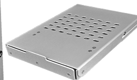
Case in closed position.

.039" (1.0 mm) x 2ea. 1/16" (1.6 mm) x 2ea. 5/64" (2.0 mm) x 2ea. 3/32" (2.4 mm) x 2ea. 7/64" (2.8 mm) x 2ea. 1/8" (3.2 mm) x 2ea. 9/64" (3.5 mm) x 2ea. 5/32" (4.0 mm) x 2ea. 3/16" (4.7 mm) x 2ea. 15/64" (6.0 mm) x 1ea.